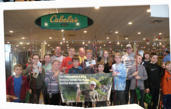
Right: 2015 Casting Kids competition at Cabela's, East Hartford, CT