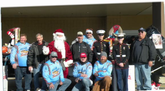
Left: 2015 Annual Toys for Tots Toy Drive sponsored by Mowhawk Valley Basscasters