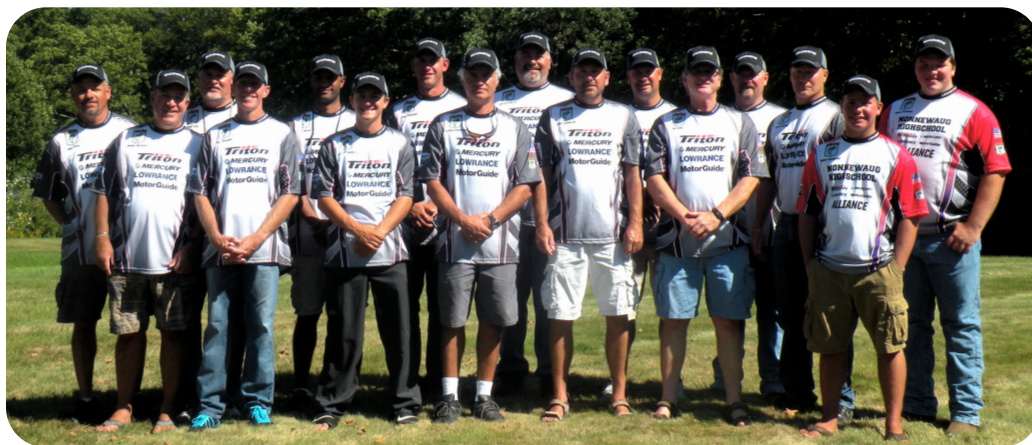
2015 Connecticut State Team. Placed 2nd at the Eastern Regionals, Connecticut River, Hartford, CT.